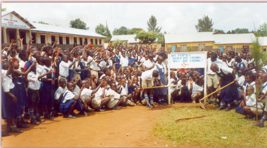
Children of Ibanda Town School Western Uganda, in this file photo, install an Anti AIDS "WHY DIE YOUNG" signage in the school compound to alert visitors and pupils on the dangers of HIV/AIDS Health linkages between schools and Non Governmental Organisations providing HIV/AIDS services is praise worthy. (File photo).

EDITOR LEGAL AFFAIRS SEVEN-ELEVEN PROPERTY COMPANY LIMITED